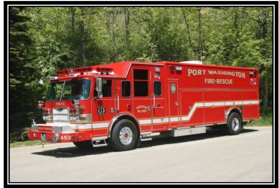
Heavy Rescue 453