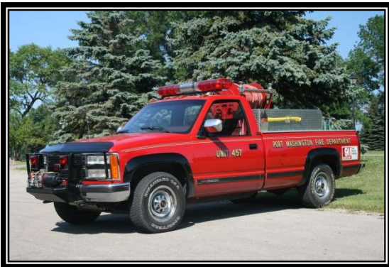
Brush Truck 457