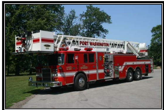
Aerial Tower 460