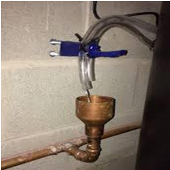
AIR GAP EXAMPLE