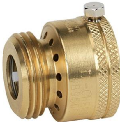
HOSE BIB VACUUM BREAKER