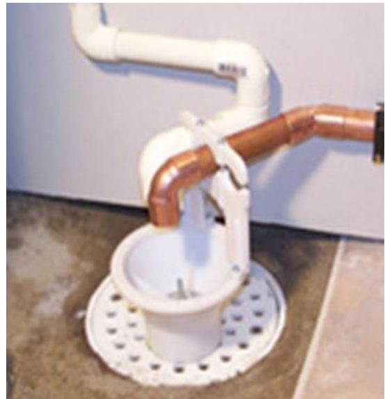
AIR GAP EXAMPLE