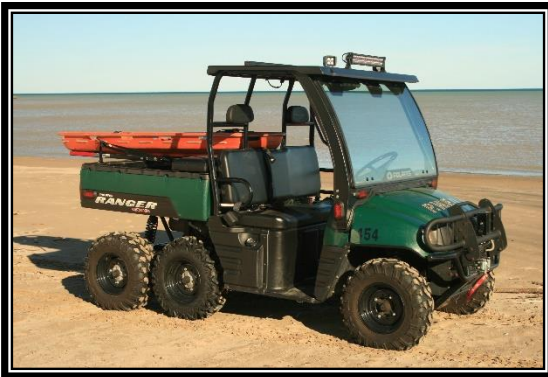
All-Terrain Vehicle 454