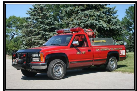
Brush Truck 457