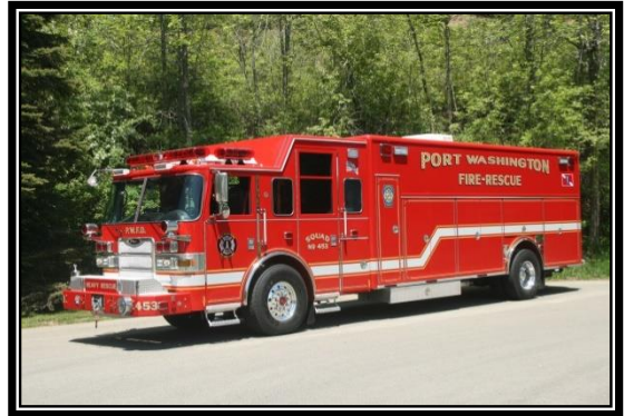
Heavy Rescue 453