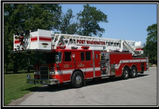
Aerial Tower 460