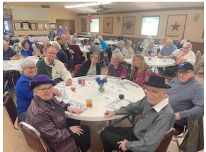
Spring Fling