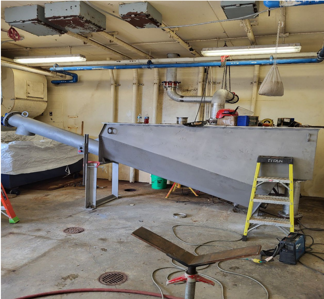
Figure 1 - New Grit Declassifier - June 11 start-up