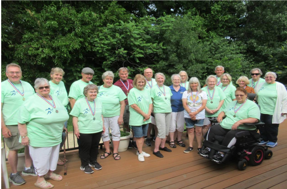
2024 Port Washington Senior Games Participants able to attend the awards breakfast!

Port Washington Adult Community Senior Center