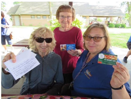
2023 Picnic Prize Winners

Powered by Connections! Discover Your Center for connections to health, creativity, enrichment, and friendships!