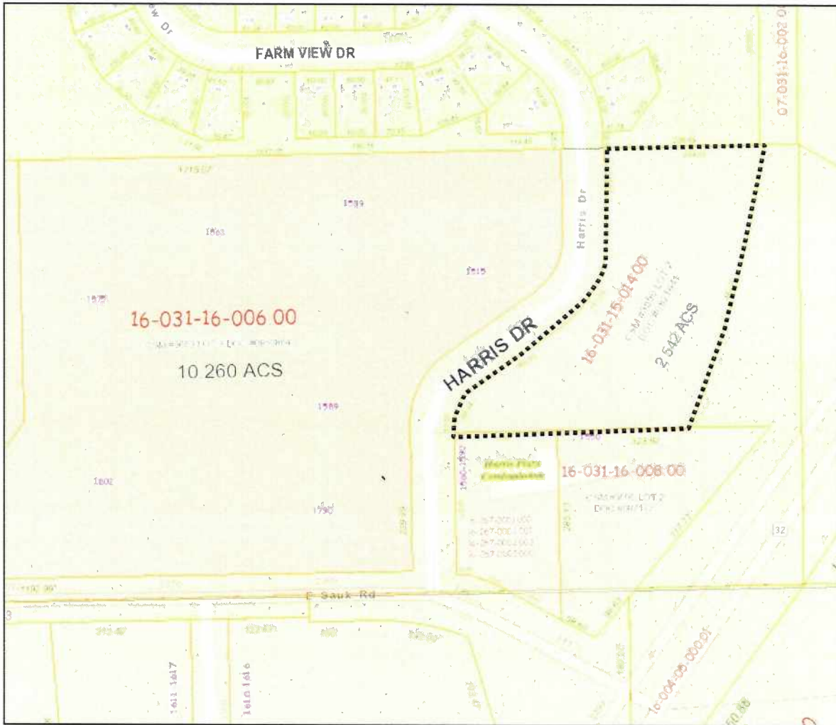
EXHIBIT A MAP OF REZONED LAND