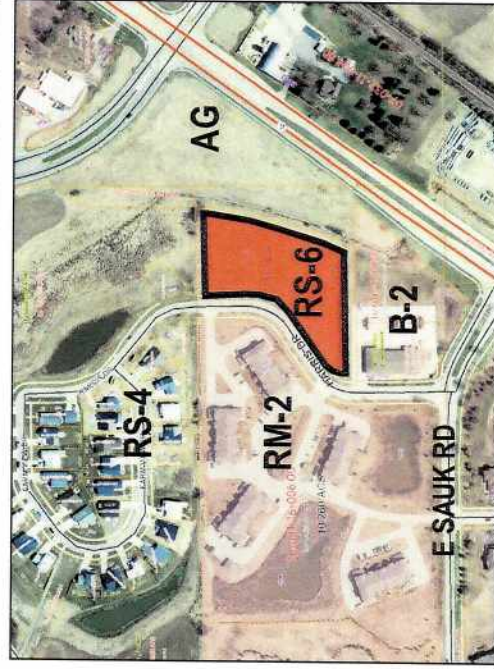
HARRIS DRIVE PROPOSED ZONING WITH CURRENT ADJACENT ZONING